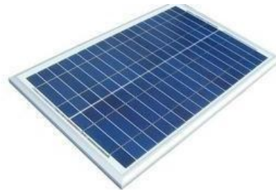
Figure 2. Solar Panel

A solar panel is a power-generating device capable of converting sunlight into direct current (DC) electricity. The electricity produced is used to supply power to automation systems, including charging batteries and serving as a power source for electronic components. In the design process of this final project, the solar panel is used as the primary source of electrical energy for the Arduino-based automated garden lighting system.