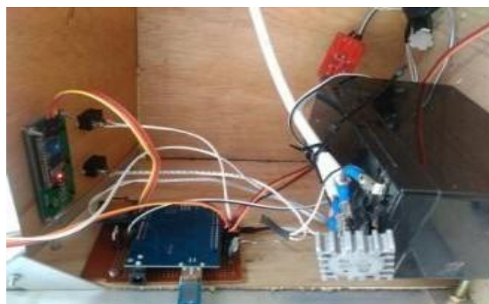
Figure 6. Electronic Components.

Solar Panel: The main component that functions to convert sunlight energy into direct current (DC) electricity through the photovoltaic effect. Solar Charge Controller: Regulates the charging process to the battery to ensure stability and safety. It also controls the current flow from the battery to the load, preventing overcharging or overdischarging. Battery: Serves as the storage medium for the electrical energy generated by the solar panel. The stored energy is in the form of DC electricity and is used to supply power to the load when sunlight is unavailable, such as at night or during cloudy weather.