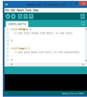
Figure 4. Interface Arduino IDE