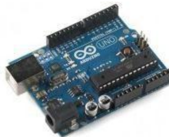
Figure 3. Arduino Uno

Arduino Uno is a microcontroller based on the ATmega328P, functioning as the brain of the automatic control system. In this final project, the Arduino Uno acts as the control center that processes data from sensors and automatically turns the garden lights ON/OFF based on environmental conditions. Arduino Uno is advantageous due to its ease of programming and flexibility in integrating with various sensors and actuators.