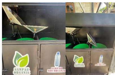
Figure 4. Non-Organic Waste Testing