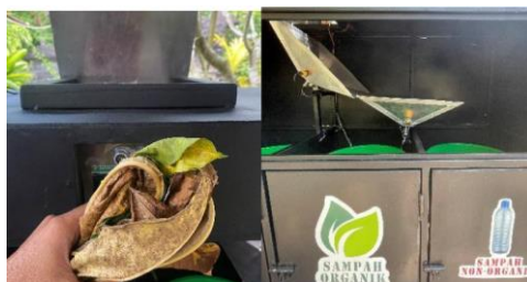
Figure 5. Organic Waste Testing

The next test was carried out using organic waste, in this case in the form of dry leaves. The leaves are put into the smart bin, and as before, the first sorting system will ensure that the waste is not metal. After that, the second sorter will detect the type of material. Since the material is recognized as a natural (organic) material, the system directs the waste to the organic bin. This process shows that the sensor works accurately in distinguishing the type of waste based on its material characteristics.