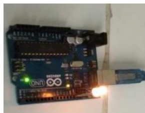
Figure 2. Arduino One

The Arduino Uno test was carried out to find out if the microcontroller was functioning properly and could execute the given commands. This testing process is carried out by turning on and off the LEDs connected to pin 13 and GND. The LEDs are programmed to turn on for 2 seconds and turn off for 2 seconds repeatedly. The test results showed that the Arduino Uno was able to respond to these commands precisely and consistently. This is an indication that the microcontroller is ready to control the other components in the system.