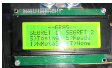
Figure 3. LCD Testing

LCD functions as a display medium to provide information about the status of the tool and the results of waste sorting to the user. The test was conducted by displaying the system name and sorting status in real-time on the LCD screen. The test results showed that the communication between the Arduino and the LCD module was smooth so that the information could be displayed clearly and accurately. This function is very helpful in increasing user interaction and education on the waste sorting process.