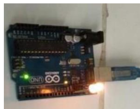
Figure 2. Arduino One

The Arduino Uno test was carried out to find out if the microcontroller was functioning properly and could execute the given commands. This testing process is carried out by turning on and off the LEDs connected to pin 13 and GND. The LEDs are programmed to turn on for 2 seconds and turn off for 2 seconds repeatedly. The test results showed that the Arduino Uno was able to respond to these commands precisely and consistently. This is an indication that the microcontroller is ready to control the other components in the system.