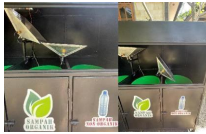
Figure 4. Non-Organic Waste Testing