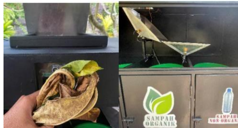
Figure 5. Organic Waste Testing

The next test was carried out using organic waste, in this case in the form of dry leaves. The leaves are put into the smart bin, and as before, the first sorting system will ensure that the waste is not metal. After that, the second sorter will detect the type of material. Since the material is recognized as a natural (organic) material, the system directs the waste to the organic bin. This process shows that the sensor works accurately in distinguishing the type of waste based on its material characteristics.