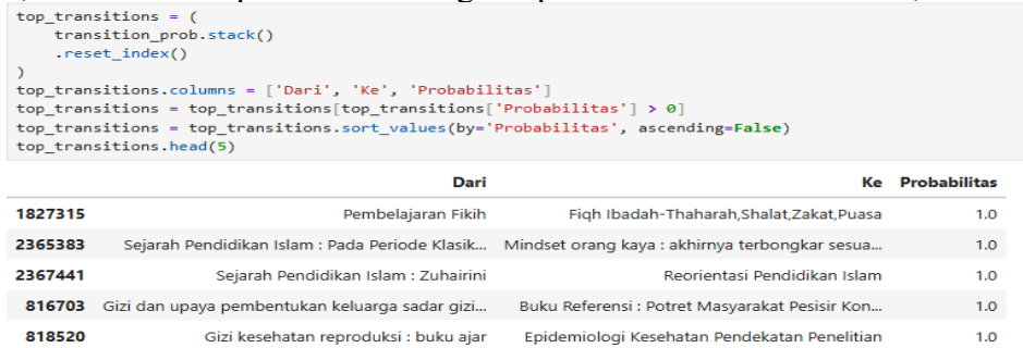
Figure 1. Top 5 Transition Probabilities

Based on the calculation of the transition probability matrix using the Markov Chain model, five transition pairs with the highest probabilities were obtained, as shown in Figure